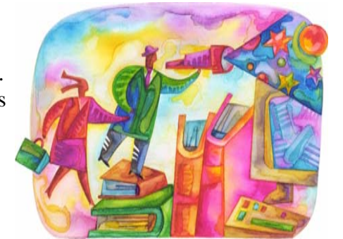
Industries with the Most Openings 2002-2012

The 2012 Job Outlook presents a summary of information about the Iowa job market and economy for ten years from 2002 to 2012. Graphs and tables depict information on industries and occupations that will impact our state's economic outlook through the year 2012. Detailed information for industry and occupational projections for 2012 and other labor market information may be requested by sending an e-mail to iwd.lmi@iwd.state.ia.us