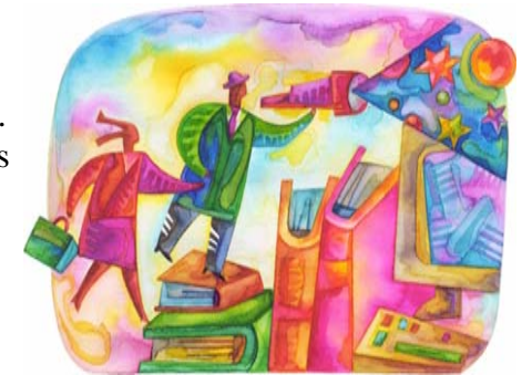
Industries with the Most Openings 2002-2012

The 2012 Job Outlook presents a summary of information about the Iowa job market and economy for ten years from 2002 to 2012. Graphs and tables depict information on industries and occupations that will impact our state's economic outlook through the year 2012. Detailed information for industry and occupational projections for 2012 and other labor market information may be requested by sending an e-mail to iwd.lmi@iwd.state.ia.us